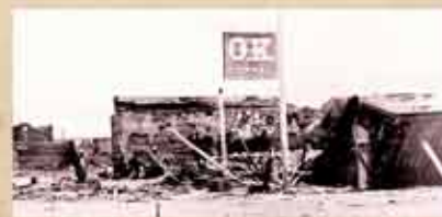
The O.K. Corral sign still stood after the disastrous May 1882 fire.