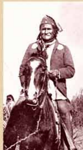
C.S. Fly photo of GERONIMO