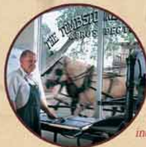
For details of the gunfight and murder inquest buy the 1881 Tombstone Epitaph.