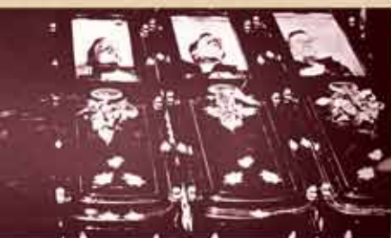
C.S. Fly's photo of the dead cowboys. All were buried in Boothill Cemetery.

Tom McLaury, who may have been unarmed, was cut down by a blast from Doc's shotgun. Frank McLaury stumbled onto Fremont Street and was shot in the head. Morgan Earp shot 19-year-old Billy Clanton.